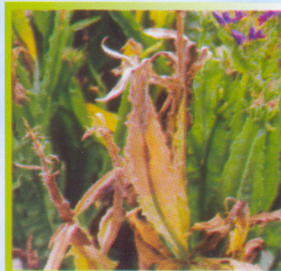
Botrytis in Statice