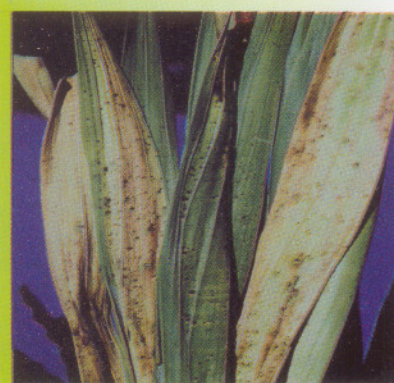
Botrytis in Gladiolus